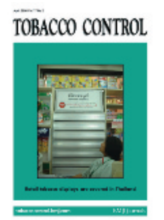
Cover: Thailand again leads the way: all tobacco retail displays are covered.