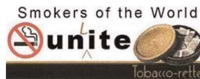
An advertisement for the Swedish Match company's oral tobacco product, Tobaccorette.

As public health workers around the world continue to debate harm reduction policies, including the place within them of oral tobacco, South Africa may be about to see whether a significant new body of South African cigarette smokers replaces some or all of their smoking with snus. They will also be watching to see how BAT markets the product and whether it tries to make health claims about it. Last year, scientists at the University of Pretoria confronted Swedish Match about health claims on a website advertisement that implied that Tobaccorette had no health hazards. The company later shut down the site, claiming it had not approved of the ad.