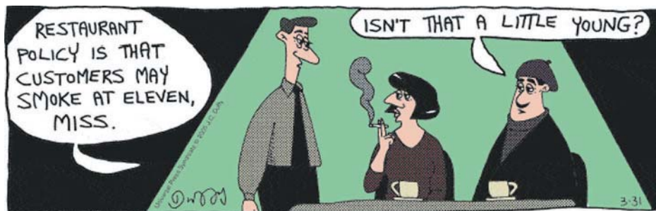
THE FUSCO BROTHERS © 2005 Lew Little Ent. Dist. By UNIVERSAL PRESS SYNDICATE. Reprinted with permission. All rights reserved.