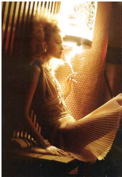
Fashion magazines such as Italian Vogue persist in showing young female models

most fashion conscious and stylish country in the world, passed and implemented more comprehensive legislation on smoke-free public places. Furthermore, the legislation appears to be working, with few breaches being reported. However, it would appear that some in the Italian fashion world are finding their addiction to tobacco more difficult to break. The March and April editions of Italian Vogue (regarded as the international fashion “bible”) persisted in showing young female models smoking in their fashion pages. The March edition featured four single and three double fashion spreads, while the April edition showed smoking in three single and one double spread. In Vogue ’s own words, and illustrated by the seductive images of the world famous photographer Steven Meisel who took many of these pictures, young women’s smoking still symbolises glamour (“Perfection Everyday”), style (“Variations on Chic”), emancipation (“The power of Vogue Style”), sexual allure (“Madame”), and European womanhood (“Black Russian”, “French-outsider, don’t do it, chic and wild, dark and elegant, fashion, attitude, rebel”).