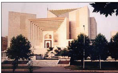
Pakistan: the Supreme Court Pakistan in Islamabad.

The court's response gained widespread media coverage, and understand-