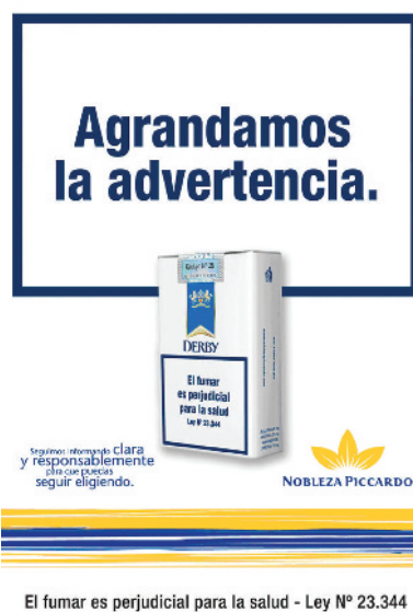
Argentina: one of BAT's advertisements publicising its "responsible" voluntary increase in the size of its pack health warning.

To everyone working to reduce disease and premature death caused by tobacco, implementation of the World Health Organization's Framework Convention on Tobacco Control (FCTC) is now the most important single target. Conversely, to the international tobacco industry, the prevention of full and effective implementation of the FCTC must be the topmost priority for trying to ensure that business goes on as usual. In Latin America, the industry must be drawing hope from the deal forged between two of the world's largest tobacco companies, Philip Morris and British American Tobacco (BAT), with