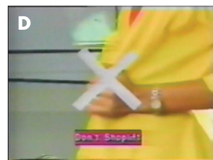
Scenes from BAT's training video for Benson & Hedges saleswomen, who were urged, "Don't shoplift!"