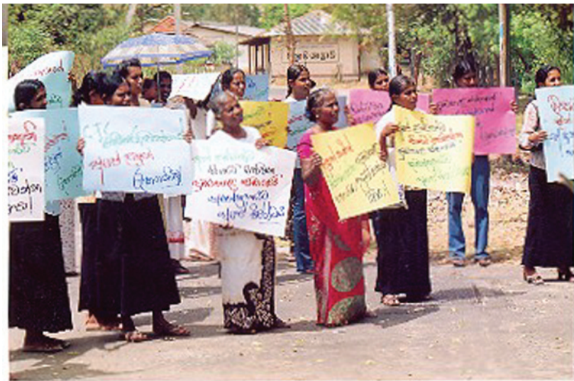
Sri Lanka: protestors demonstrating outside a hotel where BAT was trying to launch a new cigarette brand to retailers.

To be eligible for a “Be True” grant, applicants must reside in one of 10